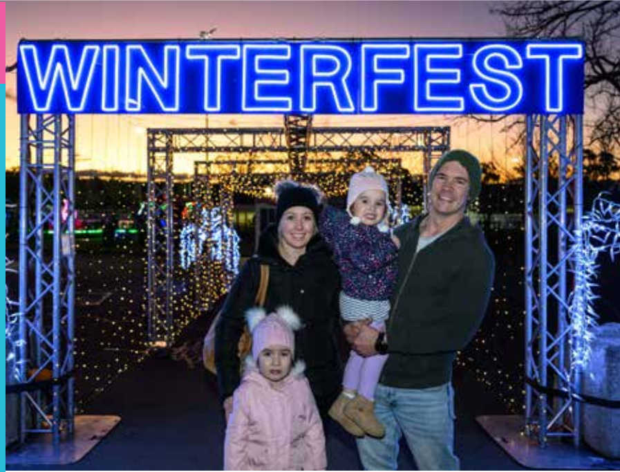
Mayor of Camden