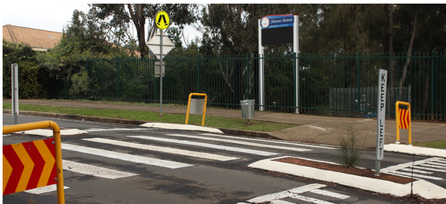
Pedestrian crossing outside Mount Annan Public School before being upgraded