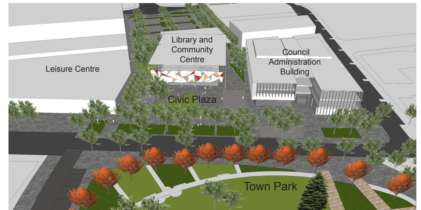
Visualisation of Civic Precinct in Oran Park