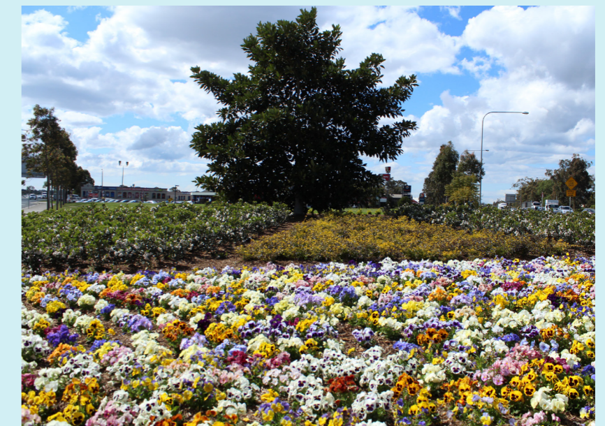
New plantings at corner of Camden Valley Way and Narellan Road

Council has allocated $153,000 in the 2015/16 Budget for this project.