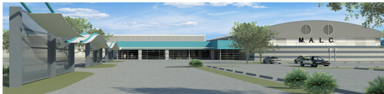
Visualisation of Mount Annan Leisure Centre upgrade

Community feedback will be collated and a final design will be submitted as part of an official development application in 2016.