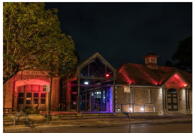
Camden Library was illuminated in orange for Harmony Day

Multicultural March and Harmony Day encourages and celebrates the social inclusion of people from all backgrounds, their contributions to our community and cultural diversity. The project received a Highly Commended at the Australian Multicultural Marketing Awards in 2016.