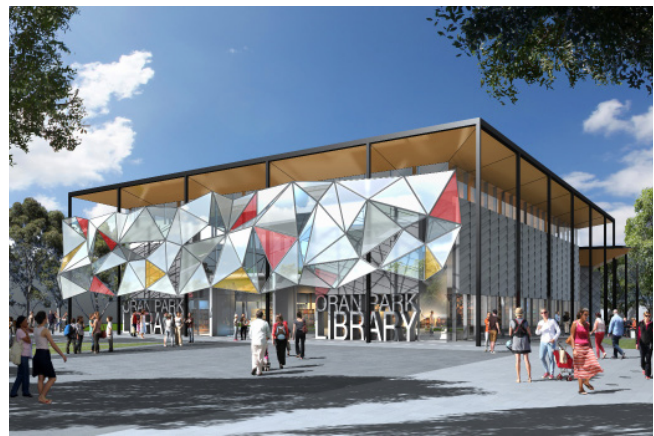
Artist impression of the Oran Park Library and Community Centre.