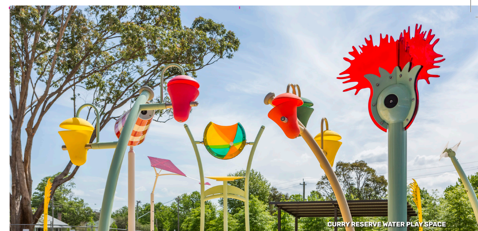
CURRY RESERVE WATER PLAY SPACE